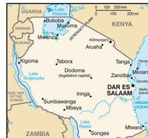
Map of Tanzania and surrounding countries.