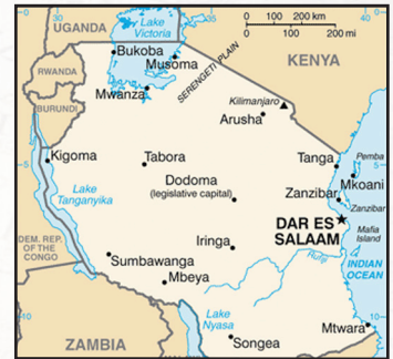
Map of Tanzania and surrounding countries.

On October 8, 2014, Tanzanian President Jakaya Kikwete formally received a draft of the new proposed constitution from the Constituent Assembly. Whereas mere weeks before it had seemed this process would be postponed until after the 2015 elections, the Constituent Assembly forged ahead and delivered on its promise to conclude deliberations by the beginning of October. Controversially, this draft was approved without the participation and consent of a large number of opposition members who had staged a boycott of the proceedings, claiming that the government had hijacked the constitution-making process and that their voices were not being heard. There are several points of contention between supporters of the proposed constitution and those in opposition, but one of the most fundamental issues is the structure of the union between the mainland and Zanzibar.