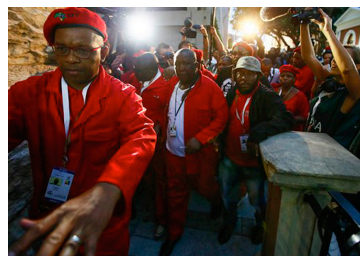
South African Economic Freedom Fighters leader Julius Malema, center, after he and supporters disrupted the official opening session of Parliament in Cape Town, South Africa, Thursday, Feb. 12, 2015. Security guards removed the opposition lawmakers who interrupted an annual address by President Jacob Zuma and demanded that he answer questions about a spending scandal.