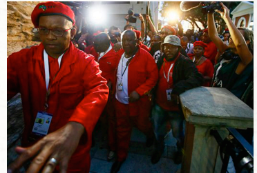
South African Economic Freedom Fighters leader Julius Malema, center, after he and supporters disrupted the official opening session of Parliament in Cape Town, South Africa, Thursday, Feb. 12, 2015. Security guards removed the opposition lawmakers who interrupted an annual address by President Jacob Zuma and demanded that he answer questions about a spending scandal.