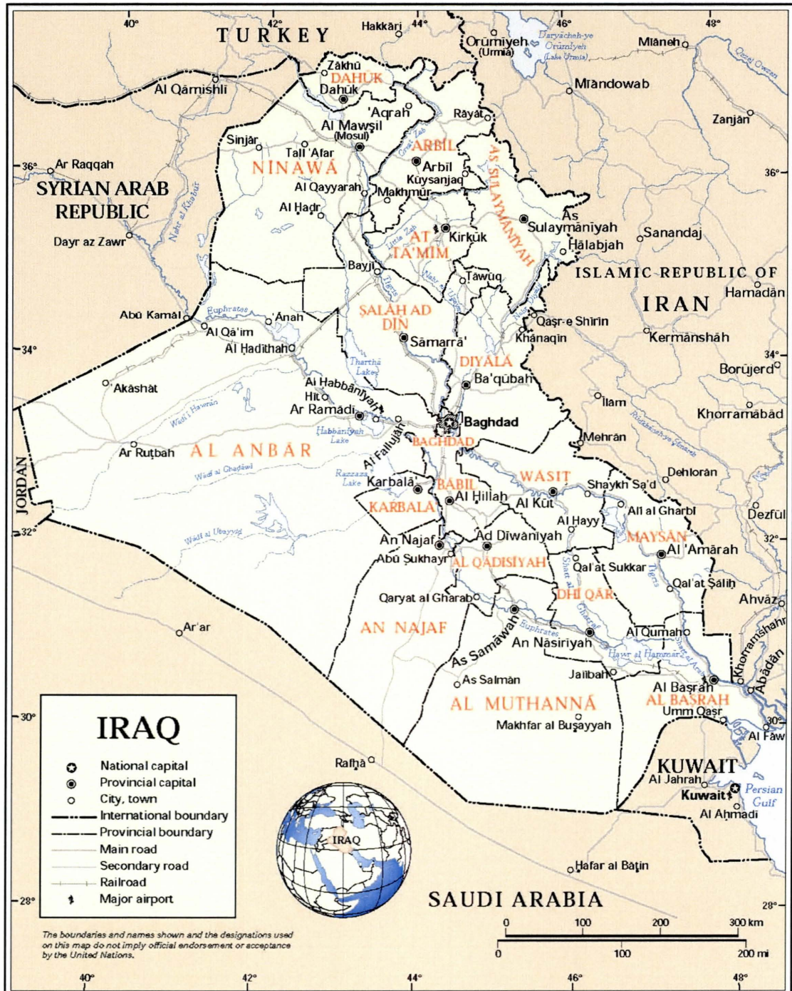
Figure 1. Iraq

The classification markings are original to the Iraqi documents and do not reflect current U.S. classification.