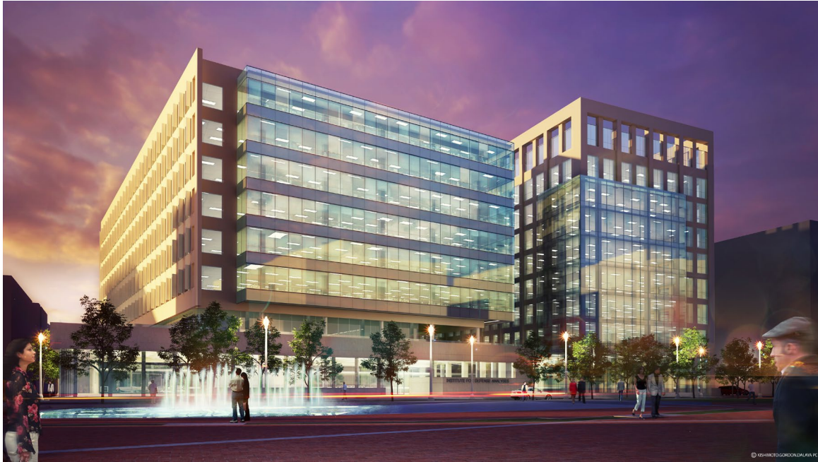
Building – Northeast View