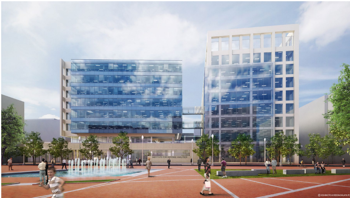
Building – Southwest View