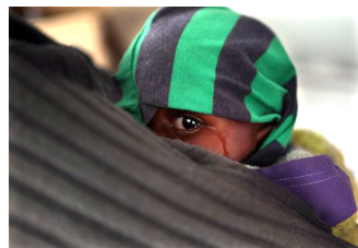
A child cries as she awaits hospital treatment at a temporary refugee camp set up for foreign nationals fleeing attacks from South Africans in Johannesburg, South Africa, Saturday, April 18, 2015. Mobs in South Africa attacked shops owned by immigrants in poor areas of the city overnight following similar violence in another part of the country that killed six people, according to media reports.