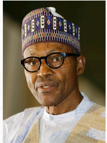
Nigerian former Gen. Muhammadu Buhari speaks moments after he was presented with a certificate to show he won the election in Abuja, Nigeria, Wednesday, April 1, 2015. Nigerian President Goodluck Jonathan conceded defeat to Buhari, a 72-year-old former military dictator, who was elected in a historic transfer of power following the nation's most hotly contested election ever.

In Anambra State , All Progressives Congress (APC) politicians called for the election to be canceled, accusing the ruling party of hijacking ballots and manipulating the collation process. A polling center in Akwa , also in Anambra State, was bombed early in the day, but voters returned later to cast their ballots. In Enugu State , a polling station was bombed, but fortunately no one was injured. In Bauchi State , a curfew was also imposed, leading to peaceful protests outside the offices