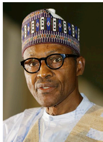
Nigerian former Gen. Muhammadu Buhari speaks moments after he was presented with a certificate to show he won the election in Abuja, Nigeria, Wednesday, April 1, 2015. Nigerian President Goodluck Jonathan conceded defeat to Buhari, a 72-year-old former military dictator, who was elected in a historic transfer of power following the nation's most hotly contested election ever.