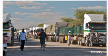
Trucks backed up at an African border crossing. Photo, “Between P and R,” ibeatty . (Source: Karen Hasse, “Non-tariff Barriers Choke African Trade,” Good Governance Africa , February 1, 2013, http://gga.org/stories/editions/aif-8-duty-bound/non-tariff-barriers-choke-african-trade/view/ .)

Africa's share of world trade is small, and Africa trades surprisingly little with itself. The World Economic Forum's Africa Competitiveness Report 2015 estimates that the continent's share of global trade is around 2 percent. Of that, only around one-tenth of Africa's global trade total is intra-African commerce. This share compares unfavorably with intra-regional trade in other world regions—21 percent in the Association of Southeast Asian Nations (ASEAN), 48 percent in the countries covered by the North American Free Trade Agreement (NAFTA), and 65 percent within the European Union (EU). According to experts, including the World Bank, a major factor restricting intra-African trade is the problem of “ thick borders ,” meaning the complex of tariff and, even more important, non-tariff restrictions that slow down traffic across African frontiers. Recently, three of Africa's regional economic groupings have announced progress toward a new free-trade area. It is worth examining whether the agreements announced could succeed in effectively addressing the practical problems that impede intra-African trade.