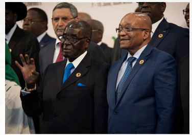
Zimbabwean president and chair of the African Union Summit Robert Mugabe, left, stands next to South African president Jacob Zuma at the African Union summit in Johannesburg, on June 14, 2015.

The African Union (AU) held its 25th summit in South Africa from June 7 to 15, 2015. Media coverage of the meeting was dominated by the drama surrounding the participation of Sudanese President Omar al-Bashir, who has been indicted by the International Criminal Court for war crimes. That controversy aside, the summit produced some interesting results. One such was a resolution that pledged to have “united and functioning single military” in the form of the African Standby Force (ASF) by the end of this year. This ambitious goal is not likely to be fulfilled in a fashion consonant with the original concept for the ASF. Nevertheless, it is worth looking at the status of the AU’s effort to create an African response force and to examine what progress might be achievable in the near term.