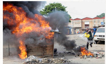
In this Tuesday, May 26, 2015, file photo, an opposition protester throws water to put out flames on a burning barricade set by him and others, when it started to burn overhead electricity cables providing power to the neighborhood, in the Buyenzi district of the capital Bujumbura, Burundi. Demonstrators said they will continue to protest until President Pierre Nkurunziza steps down at the end of his second term.

Pro-democracy activists influence each other, learn from each other, and work together by coalition building. This became clear in March 2015 , when activists from Senegal’s Y’en a Marre and Burkina Faso’s Le Balai Citoyen were invited to the DRC for a series of workshops geared toward engaging youth in politics. The visiting activists were arrested and declared personae non gratae in the DRC. Pro-democracy activists across sub-Saharan Africa are also becoming emboldened as they see successes in places they never thought imaginable. In an interview with the author, one activist from Burkina Faso noted, “No one ever thought Compaoré would be forced out. If it can happen in Burkina, it can happen anywhere.” A Y’en a Marre activist interviewed by the author asserted, “We will go wherever we are invited in Africa; they might try to intimidate us but they can’t and they won’t stop us.” The activist also said that members of the group had been invited to Burundi just before the attempted coup d’état .