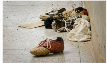
Abandoned shoes lie next to the Elgon A hostel inside the Garissa University College compound that was the scene of an attack by al-Shabaab gunmen, in Garissa, Kenya. Kenya launched air strikes against al-Shabaab Islamic militants in Somalia, following the extremist attack that killed 148 people, a military spokesman said.

The murder of 148 Kenyan university students at Garissa University College by al-Shabaab terrorists on April 2, 2015, has been the subject of wide media coverage and expert analysis. The Garissa attack has been characterized as evidence of al-Shabaab's resilience in the face of military defeats inside Somalia. The attack is also seen as representing al-Shabaab's evolution from "a popular resistance movement into a full-blown, international terrorist organization." Both these theses seem valid, but other conclusions to be drawn from Garissa are potentially even more important. The first is that al-Shabaab is becoming ever more deeply rooted in Kenya itself. The second is that the Kenyan government's response to the attack is following patterns that in the past have only exacerbated the problem.