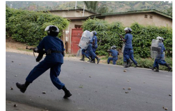
Burundi riot police fire blanks as they chase stone-throwing demonstrators during clashes in the Musaga district of Bujumbura, Burundi, Tuesday April 28, 2015. Anti-government street demonstrations continued for a third day after six people died in protests against the move by President Pierre Nkurunziza to seek a third term.