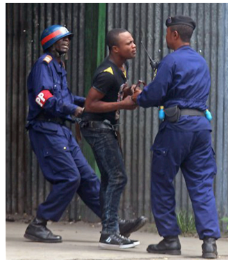
An anti-government protestor, center, is arrested by Congo riot troops, during a protest against a new law that could delay elections to be held in 2016, in the city of Kinshasa, Democratic Republic of Congo, Monday, January 19, 2015.