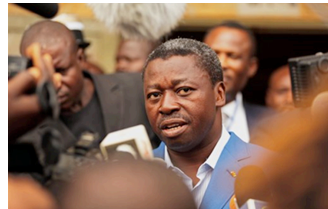
Togo's Incumbent President Faure Gnassingbé speaks to media after casting his ballot at a polling station in Lomé, Togo, Saturday, April 25, 2015. Togo's president, whose family has ruled this West African nation for nearly 50 years, appealed for peace as he vied for re-election Saturday against four other candidates.