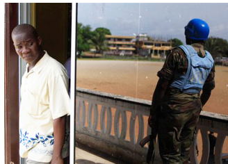
A United Nations peacekeeper from Nigeria is reflected in mirrored glass outside the office of opposition leader George Weah, not pictured, who is being protected by seven U.N. soldiers, at opposition party headquarters in Monrovia, Liberia Wednesday, Nov. 9, 2011.