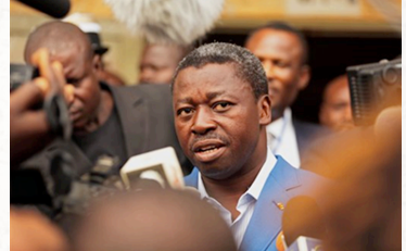
Togo's Incumbent President Faure Gnassingbé speaks to media after casting his ballot at a polling station in Lomé, Togo, Saturday, April 25, 2015. Togo's president, whose family has ruled this West African nation for nearly 50 years, appealed for peace as he vied for re-election Saturday against four other candidates.

On May 4, 2015, President Faure Gnassingbé of the Union for the Republic (UNIR) party was sworn in for a third term after winning reelection with 58.77 percent of the vote in elections held on April 25. Jean-Pierre Fabre, the candidate of a coalition of five opposition parties named the Combat for Political Change (CAP 2015), came in second place, garnering 35.19 percent of the vote. The poll was widely deemed free and fair by international and regional actors, including the African Union and the Economic Community Of West African States (ECOWAS). Reminiscent of the 2010 presidential elections, which he also lost, Fabre denounced the election results as fraudulent and on April 29 called for protests: “I call on the people to mobilize by all legal means to counter this new coup.”