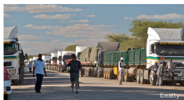
Trucks backed up at an African border crossing.