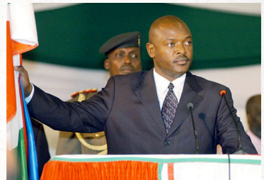
Former rebel leader Pierre Nkurunziza holds in his right hand Burundi's national flag and another symbolizing the unity of Burundi's ethnic groups as he takes the presidential oath in parliament in the capital, Bujumbura, in this file photo.

One of Nkurunziza's political rivals, Hussein Radjabu, was broken out of jail on March 1. He allegedly had support from party and security officials. Radjabu, former general secretary of the CNDD-FDD, was once considered