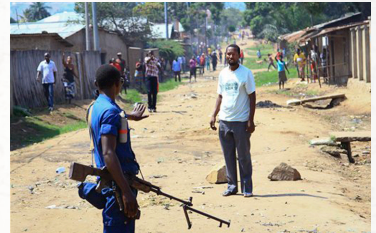
A man refuses to leave the road after police order residents to get off the streets and into their houses, during opposition demonstrations in the Mutakura neighborhood of the capital Bujumbura, Burundi Tuesday, June 2, 2015. Burundi's electoral commission is considering alternative dates for national elections amid growing calls for the polls to be postponed due to political unrest, an official said Tuesday as anti-government protests returned to parts of the capital.

Security in Burundi has been a source of conflict since the post-colonial restoration of independence in 1962. Although members of the Tutsi ethnic group are a minority in Burundi (approximately 15 percent of the population), they have historically dominated the army. There are numerous examples of Tutsi repression of the Hutu majority. In 1972, following a violent rebellion against the Tutsi government by members of the Hutu majority, the government responded by killing between 100,000 and 200,000 Hutu civilians over the course of a few months. In the early 1990s, Burundi's first Hutu president, Melchior Ndadaye, was elected in the country's first multiparty elections. Security sector reform was one of his key campaign promises . Feeling threatened, members of the military assassinated Ndadaye in October 1993, triggering civil war.