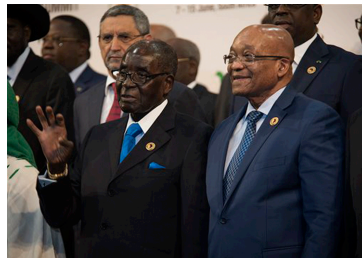
Zimbabwean president and chair of the African Union Summit Robert Mugabe, left, stands next to South African president Jacob Zuma at the African Union summit in Johannesburg, on June 14, 2015.