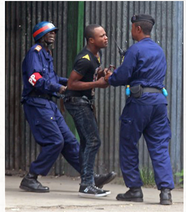
An anti-government protestor, center, is arrested by Congo riot troops, during a protest against a new law that could delay elections to be held in 2016, in the city of Kinshasa, Democratic Republic of Congo, Monday, January 19, 2015.

On March 2, Kabila set a 120-day deadline for the implementation of découpage , “a constitutional change introduced in 2006 intended to divide Congo’s 11 provinces into 26. . . . The delay is not surprising given that découpage is one of the most complex processes that the government has had to grapple with since the official end of the war.” The government has neither budgeted for the process nor designed an implementation plan. In pursuing découpage now, Kabila may be able to extend his term by claiming he needs additional time and money to complete the rezoning of the DRC’s political map.