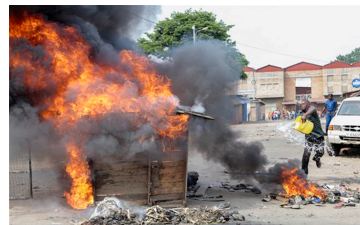
In this Tuesday, May 26, 2015, file photo, an opposition protester throws water to put out flames on a burning barricade set by him and others, when it started to burn overhead electricity cables providing power to the neighborhood, in the Buyenzi district of the capital Bujumbura, Burundi. Demonstrators said they will continue to protest until President Pierre Nkurunziza steps down at the end of his second term.