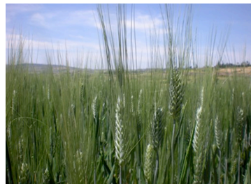
A half-hectare farm planted with a new variety of wheat near Debre Zeit, in Ethiopia's Amhara region.