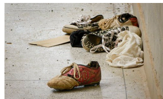
Abandoned shoes lie next to the Elgon A hostel inside the Garissa University College compound that was the scene of an attack by al-Shabaab gunmen, in Garissa, Kenya. Kenya launched air strikes against al-Shabaab Islamic militants in Somalia, following the extremist attack that killed 148 people, a military spokesman said.