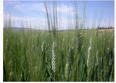
A half-hectare farm planted with a new variety of wheat near Debre Zeit, in Ethiopia's Amhara region.

It is frequently asserted that women make up the majority of agricultural workers in Africa—anywhere from 60 to 80 percent of the workforce. Much international assistance programming is either implicitly or explicitly based on this belief. New analysis from the World Bank, supported by other research, calls these figures into question, and suggests a range closer to 40 to 50 percent. What are the implications of this lower range for programming and development in Africa?