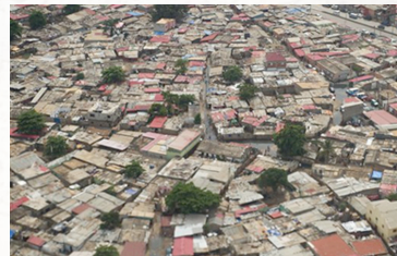
Homes in a poor neighborhood of Luanda, Angola, viewed from the air, on Sunday May 4, 2014.

On May 8, 2015 , three youth activists were detained at the start of a demonstration in the Rangel district in the capital of Angola, Luanda. Organized by the Grupo Mura, a collective of individuals fighting for social equality in Angola, protesters were demanding increased access to water, electricity, and sanitation. Similar scenes have played out across Angola as police routinely arrest protesters minutes after their arrival at protest locations and often hold them for days. Angolan youth activists have not been deterred. In fact, protest activity has increased in the country, which rarely experienced protests before 2011. Even with the government's attempt to crack down on any opposing views, civil society has recently become bolder in voicing grievances.