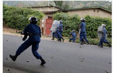
Burundi riot police fire blanks as they chase stone-throwing demonstrators during clashes in the Musaga district of Bujumbura, Burundi, Tuesday April 28, 2015. Anti-government street demonstrations continued for a third day after six people died in protests against the move by President Pierre Nkurunziza to seek a third term.