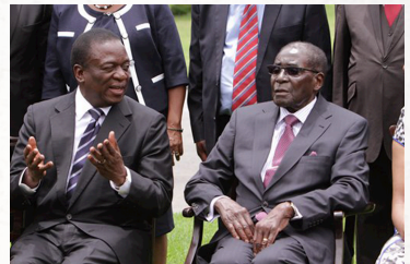
Emmerson Mnangagwa, left, Vice President of Zimbabwe, chats with Zimbabwean President Robert Mugabe after the swearing-in ceremony at State House in Harare, Friday, December 12, 2014. Mnangagwa was sworn in following a cabinet reshuffle that saw former deputy President Joice Mujuru dismissed from her post, over allegations that she plotted to remove the Zimbabwean President from power.

Although MDC-T and UMDC boycotted the polls, ZANU-PF did not enjoy a smooth campaign period, because a record number of former ZANU-PF officials—believed to be aligned to Mujuru—formed a coalition and ran as independents. The ruling party suspected that the coalition of independent candidates had ties to MDC-T. In the run-up to the poll, ZANU-PF cracked down on the independents. There were reports of pre-election violence in Hurungwe West and other constituencies. Hurungwe West independent candidate Temba Mliswa, who was the former chairman of ZANU-PF in Mashonaland West before his expulsion from the party, was arrested, and his supporters were assaulted by ZANU-PF youths during the campaign. Mliswa asserted : "The six village heads were accused of supporting me and subsequently beaten. The assault was perpetrated in full view of the nine ZRP [Zimbabwe Republic Police] officers in a Land Rover and members of the President's Office present." Despite the violence aimed at him, he remained outspoken, saying , "I am not afraid. . . there is so much desperation [in ZANU-PF], I see it."