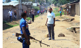
A man refuses to leave the road after police order residents to get off the streets and into their houses, during opposition demonstrations in the Mutakura neighborhood of the capital Bujumbura, Burundi Tuesday, June 2, 2015. Burundi's electoral commission is considering alternative dates for national elections amid growing calls for the polls to be postponed due to political unrest, an official said Tuesday as anti-government protests returned to parts of the capital.