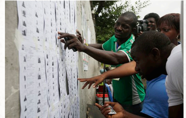
Nigerian people look for their names before they register to vote in Lagos, Nigeria, Saturday, April 11, 2015. Nigerians voted for state governors and assemblies in elections where the opposition hoped to make gains following its stunning victory that unseated President Goodluck Jonathan.

The APC's victory at the national level was to some extent reinforced by the outcome of state-level elections. APC gubernatorial candidates won elections in 19 states, while PDP candidates won in 10 states. Before the elections, the PDP controlled 22 states. After these elections, the APC now controls 22 states to the PDP's 13. The All Progressives Grand