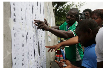
Nigerian people look for their names before they register to vote in Lagos, Nigeria, Saturday, April 11, 2015. Nigerians voted for state governors and assemblies in elections where the opposition hoped to make gains following its stunning victory that unseated President Goodluck Jonathan.