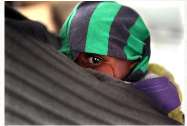
A child cries as she awaits hospital treatment at a temporary refugee camp set up for foreign nationals fleeing attacks from South Africans in Johannesburg, South Africa, Saturday, April 18, 2015. Mobs in South Africa attacked shops owned by immigrants in poor areas of the city overnight following similar violence in another part of the country that killed six people, according to media reports.

Xenophobic attacks are almost always committed by poor black South Africans against other poor Africans. Those organizing and supporting the violence assert that foreign nationals commit more crimes than ordinary South Africans and that foreign nationals take jobs away from South Africans, contributing to the country's endemic poverty.