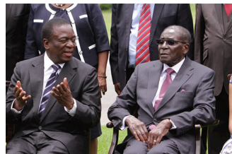
Emmerson Mnangagwa, left, Vice President of Zimbabwe, chats with Zimbabwean President Robert Mugabe after the swearing-in ceremony at State House in Harare, Friday, December, 12, 2014. Mnangagwa was sworn in following a cabinet reshuffle that saw former deputy President Joice Mujuru dismissed from her post, over allegations that she plotted to remove the Zimbabwean President from power.