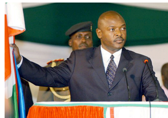
Former rebel leader Pierre Nkurunziza holds in his right hand on Burundi's national flag and another symbolizing the unity of Burundi's ethnic groups as he takes the presidential oath in parliament in the capital, Bujumbura, in this file photo.