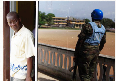
A United Nations peacekeeper from Nigeria is reflected in mirrored glass outside the office of opposition leader George Weah, not pictured, who is being protected by seven U.N. soldiers, at opposition party headquarters in Monrovia, Liberia Wednesday, Nov. 9, 2011.

On April 20, 2015, over 20 former Nigerian soldiers who “were part of the 850 members of the 15th Battalion of the United Nations Peacekeeping Mission sent to Liberia between September 2007 and April 2008” asked President-elect Muhammadu Buhari to reinstate them. After their peacekeeping deployment, the soldiers were sentenced to life in prison and forcibly retired in 2009 for mutinying over nonpayment of their peacekeeping entitlements. Their sentences were later reduced to seven years. But the soldiers still want what is owed to them: “I want them to compensate us. We are looking up to Gen. Buhari to look into our case. He has been a soldier and he would appreciate the enormity of the injustice done to us.” Recent research documents a number of other peacekeeping-related mutinies in West Africa. Do international peacekeeping deployments fuel mutiny in Africa?