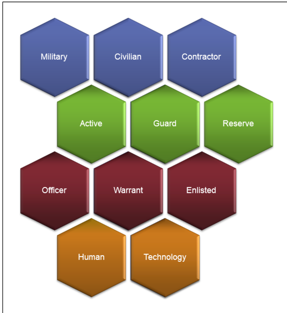
Figure 1. Four Interrelated Dimensions of Workforce Mix

gathering investments to make today in support of tomorrow’s management challenges. This paper provides currently actionable policy insights that follow from previous work, and lays out strategic research steps for providing future leaders with game-changing insights.